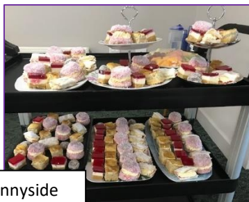
Dorrie's flowers from Sunnyside