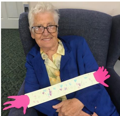
Grote knuffel (big hug in Dutch)

St. Patrick's students kindly made a number of big hugs written with warm wishes to our residents.